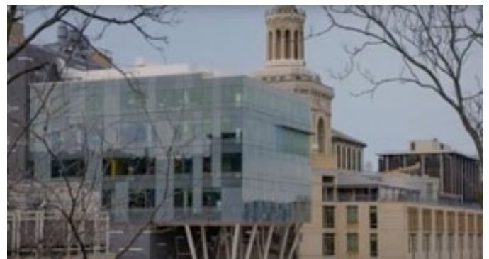
The above-ground portion of the building composing Scott Hall houses the Wilton E. Scott Institute for Energy Innovation. Construction of the interior of the building continues after the April 2016 dedication ceremony.